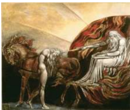
(Artist: William Blake Date: 1757-1827)

The hand of almighty shall unfold the secret of our souls. All our deadly secrets shall be unfolded. All our deadly fears shall be known. All our terrible thoughts shall reappear. All our tears shall be shed. Every eyes shall be widely opened. Every eyes shall shed its tears. Every evildoer shall be confronted. Every evildoer shall be sent to the prison of fire. Every evildoer shall be sent to prison of