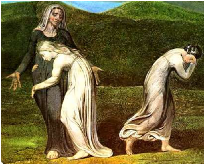
(Artist: William Blake Date: 1795)

Every entreaties shall be heard. Every will shall be executed. Every remarks shall be noted. Every theology shall be explained. Every canon shall be explained. Every interpretation shall be heard. Every soul shall be allowed. Every soul shall be admitted. There shall be no reasoning.