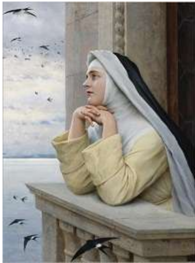
(Artist: EUGEN VON BLAAS Date: 1843-1932)

When you awake you shall be informed. When you awake you shall no more be raw. When you awake you shall be fully ripe. Be sure! When you awake the shadows shall be destroyed.