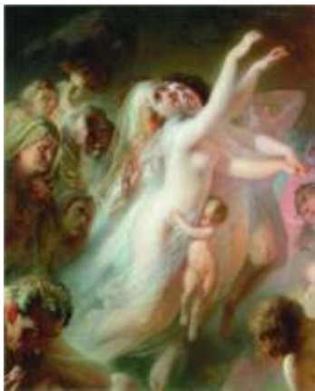
(Artist: Konstantin Makovsky Date: 1861)

Every soul shall be informed. Every soul shall be intimated. Every soul shall be resolute. Every soul shall be determined. Divine will shall be executed. Divine commands shall be given. The deaf shall hear. The blind shall see. Every flower shall bloom. Every tree shall bear its fruit. Every hearts composition shall be seen. Every soul's substance shall be tested.