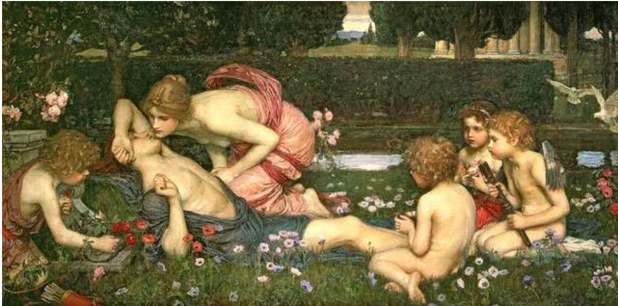
(Artist: John William Waterhouse Date: 1849-1917)

When you awake you shall have to give account. When you awake the true form shall reveal. When you awake the darkness of forms shall vanish. When you awake the charming forms shall reveal. Be sure! When you awake the shadows shall be destroyed.